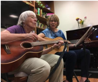
Fun at Baby Cafe

by Ruby Long, a neighbor whose work has appeared in local and national publications